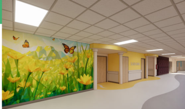
Renovations to Current Neighborhood