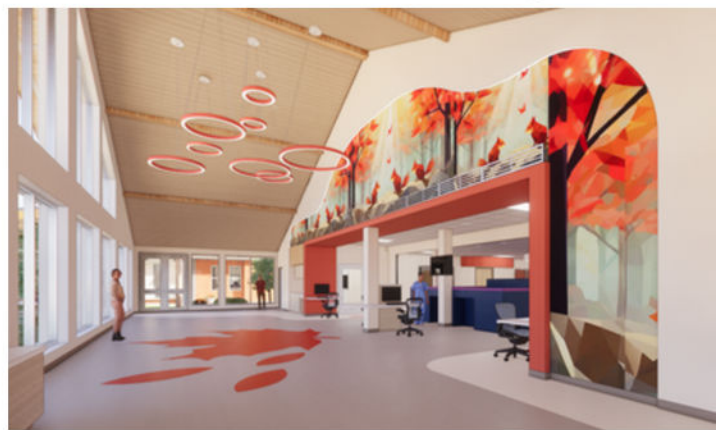
Increased Activity Space for Current Neighborhoods