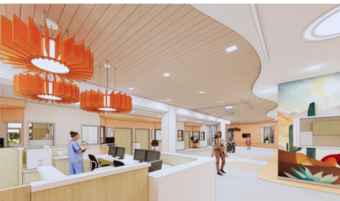
New Neighborhood Entrance