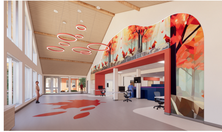
Increased Activity Space for Current Neighborhoods