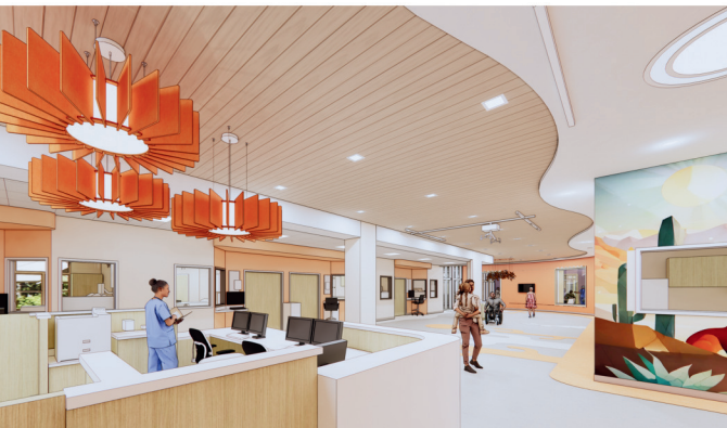
New Neighborhood Entrance