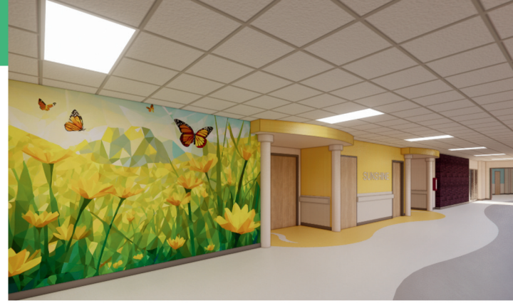
Renovations to Current Neighborhood